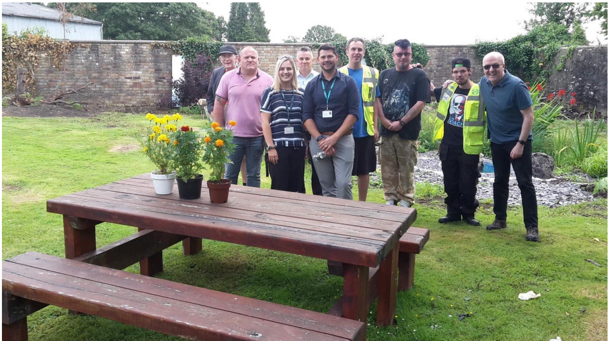
Aderyn Mental Health Hospital – receiving a new bench for their garden.